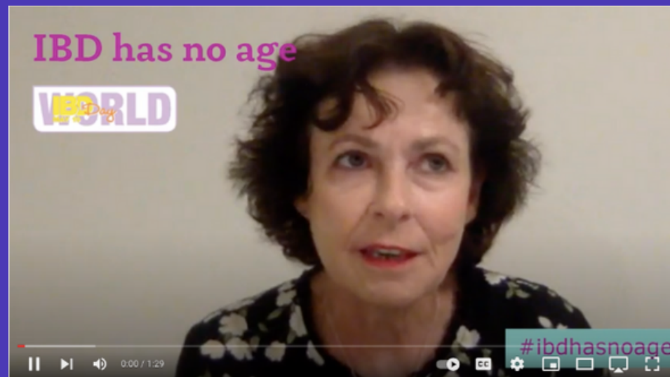
IBD has no age - Lack of research of IBD in the elderly

The more we know about a topic the easier it is to better advocate for it! Watch EFCCA discussing this topic with representatives from a focus group that involved 8 patient associations. The videos highlight some of the main concerns and realities of living with IBD as people aged 60 years and over.