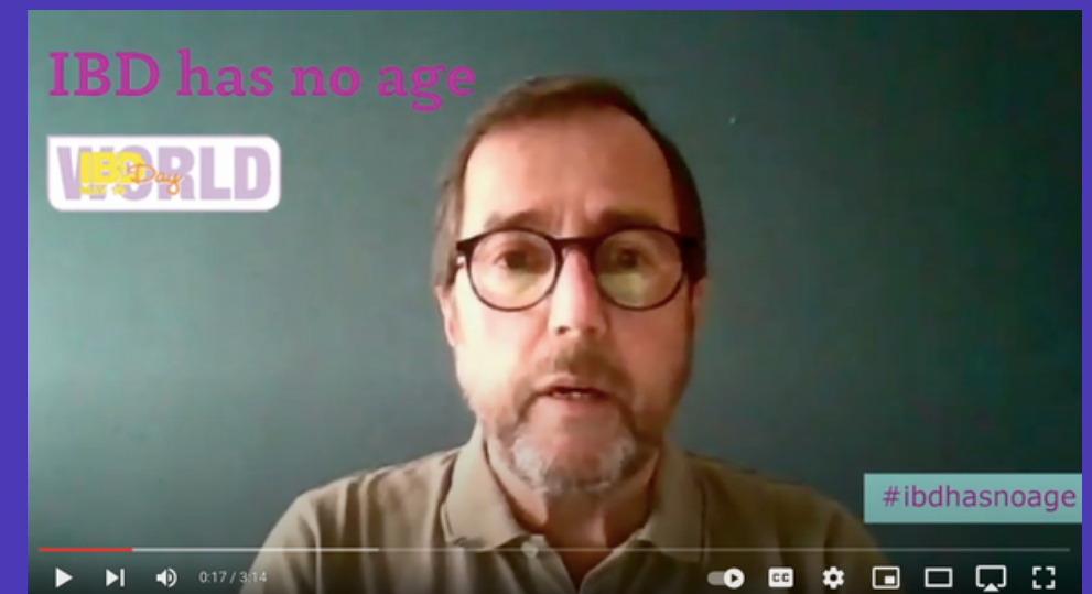
#ibdhasnoage - Personalised care