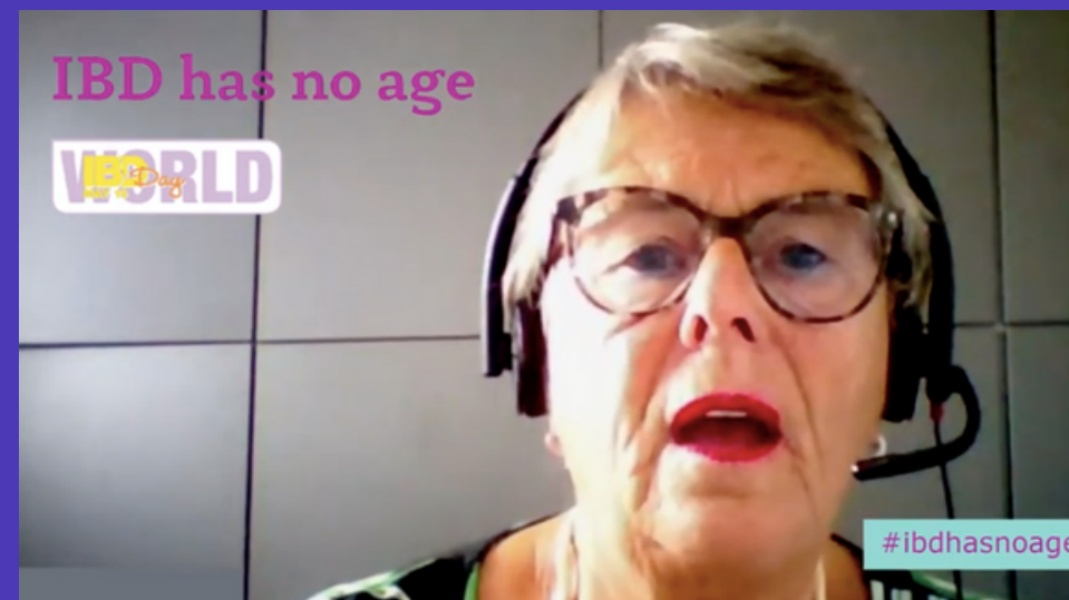
IBD has no age - Comorbidities, IBD and the elderly